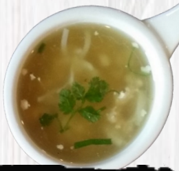
CHICKEN NOODLE SOUP