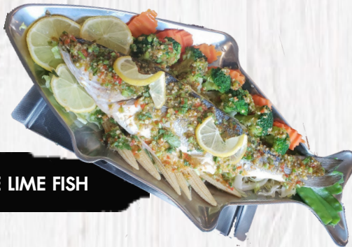
LIME LIME FISH

Fried Whole Bronzini Fish with julienned ginger, onions, bell peppers, scallions, black mushrooms, celery and mushrooms in Thai Ginger Sauce. Served with Steamed Jasmine Rice.