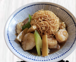
GOI SEE MEE