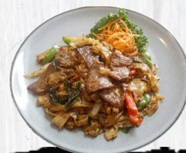
AROY DEE DRUNKEN