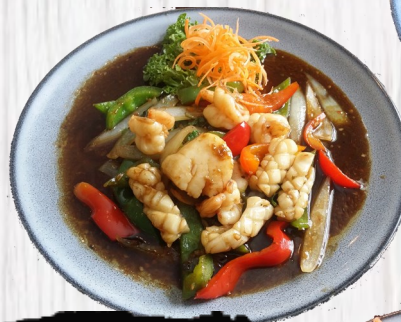
BASIL AND CHILI