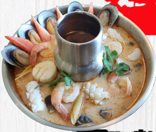
TOM YUM HOT POT