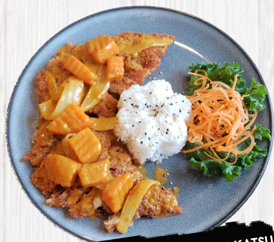
JAPANESE YELLOW CURRY CHICKEN KATSU