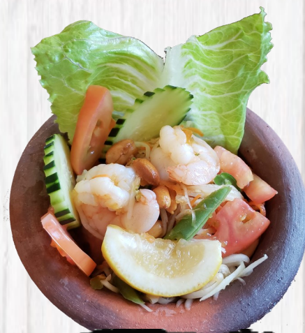
AROY DEE POK POK

Shredded crabstick and avocado in Japanese mayo served with baby spinach and ginger dressing.