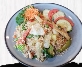
AROY DEE FRIED RICE

Choice of your favorite meat with the popular Thai flat noodle dish stir-fried with broccoli, carrots and egg in sweet soy sauce.