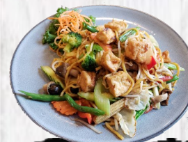
AROY DEE LO-MEIN