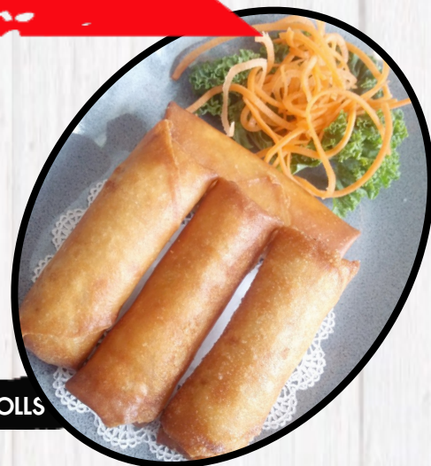
THAI SPRING ROLLS