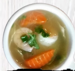
BEAN THREAD SOUP