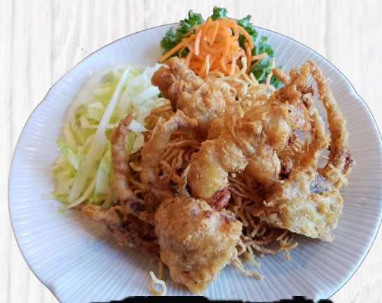
SOFT SHELL CRAB