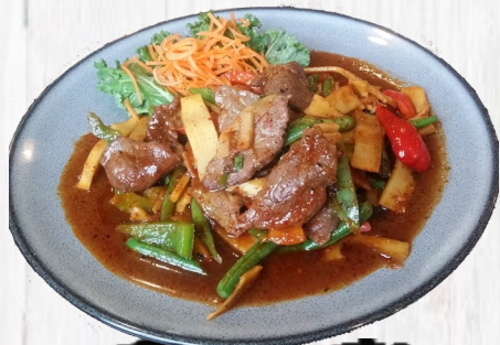
THAI PEPPER BEEF

SERVED WITH STEAMED JASMINE RICE, BROWN RICE SUBSTITUTION $1.00 EXTRA.