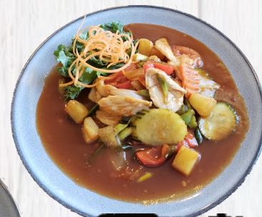
SWEET AND SOUR

Choice of your favorite meat sauteed with bell peppers, tomatoes, onions, carrots, cucumbers, pineapples and scallions in our sweet & sour sauce.